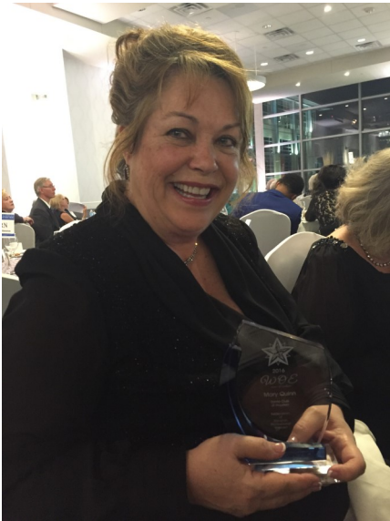
ZCH 2016 Woman of Excellence